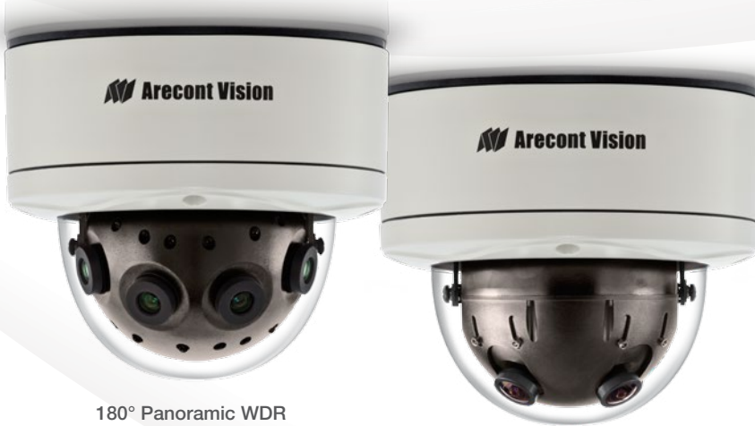
180° Panoramic WDR

H.264 All-in-One 180° and 360° Panoramic WDR Day/Night Indoor/Outdoor Dome IP Cameras